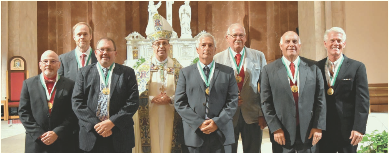
2017 St. John Bosco Award Winners

A complete list of past Award Winners can be viewed on our website under the "Activities" tab.