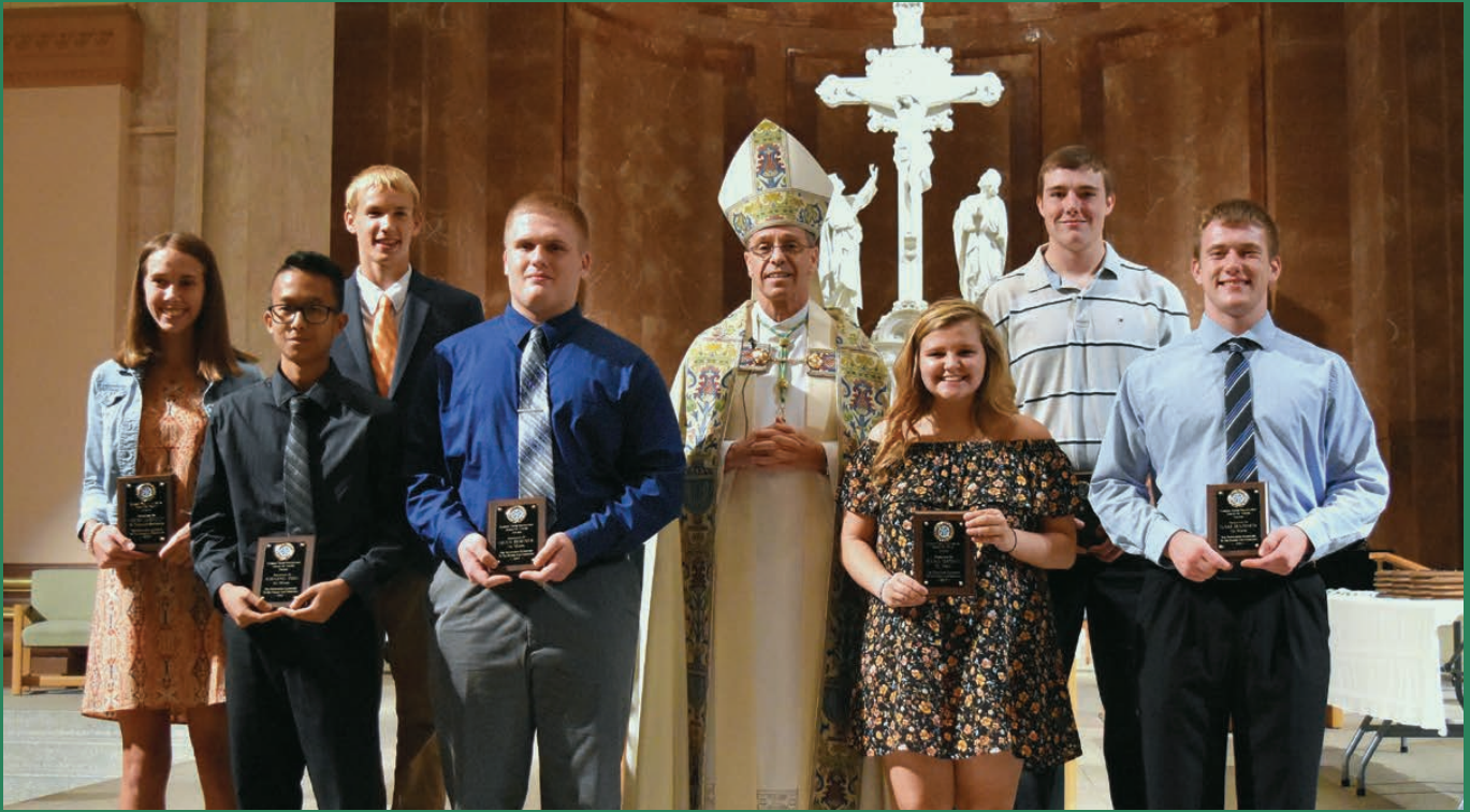
2017 Spirit of Youth Award Winners