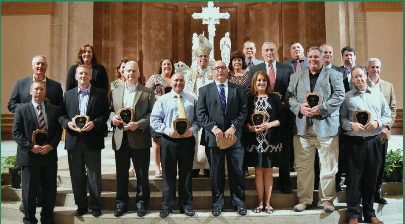
2017 MSGR. Albert Busald Award Winners